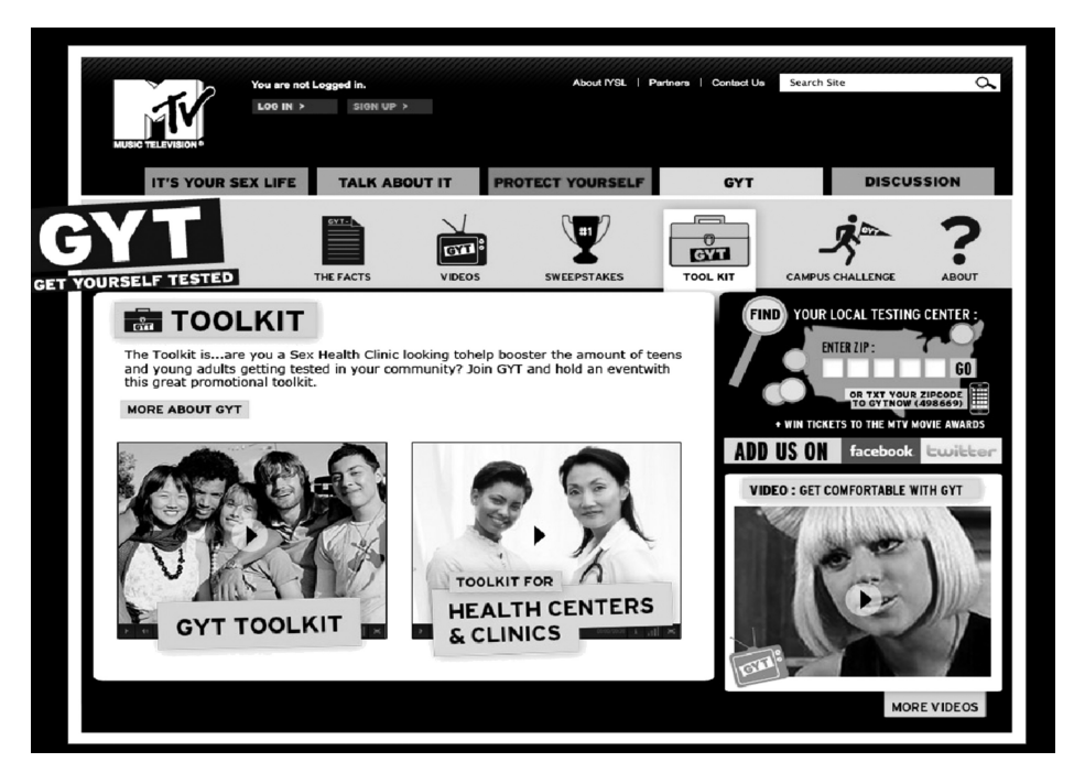
Figure 1. Screen shot of the 2010 GYT Web site.

Sexually transmitted disease testing was promoted across platforms and through partners' on-the-ground efforts. In year 1 (2009), on-the-ground activities relied predominantly on local Planned Parenthood health centers and advocates. By year 2 (2010), the campaign had expanded its partner base to include school-based health centers, state and local health departments, community organizations, colleges and universities, and high schools. GYT toolkit distribution increased from 1500 in year 1 to 4000 in year 2. Evidence from select local sites suggests that on-the-ground GYT efforts are associated with increases in testing at participating health centers, schools, and community organizations. 13-15 A 2010 consumer mail survey of teens indicated that awareness of the GYT campaign had reached 18.3%; some respondents (10%-21%) reported that GYT prompted information seeking or discussions about STDs/testing with a sex partner, family member, friend, or provider. 16 However, this survey assessed only a subset of GYT's intended audience and was unable to link reported campaign exposure to behavioral outcomes.